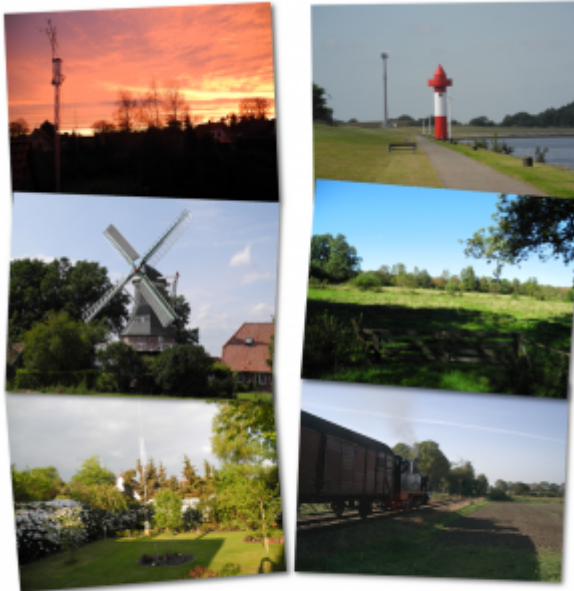
Some impressions of my QTH Latitude 53° 6' 3" N Longitude 8° 32' 27" E